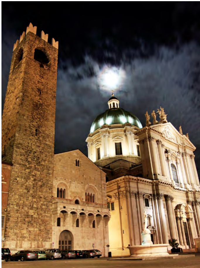
Al chiaro di luna

Sitografia: http://www.turismobrescia.it/it/punto-d-interesse/piazza-paolo-vi-gia-piazza-duomo