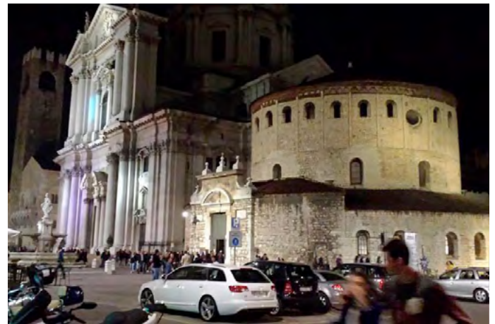
La sera

www.iluoghidelsociale.it - Via Salgari,43 - 25125 Brescia - info@iluoghidelsociale.it