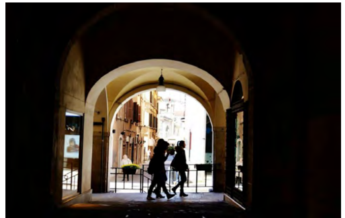
Una porta per passeggiare

on the opposite side of the colonnades there is Astra Cinema, inaugurated in 1948, closed in 2009 and reopened some years after.