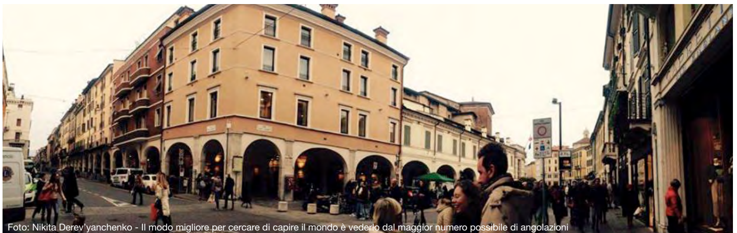
Il modo migliore per cercare di capire il mondo è vederlo dal maggior numero possibile di angolazioni

Sitografia: http://www.bresciastorica.it/la-modernita-di-via-delle-spaderie/