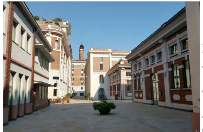
Borgo Wührer

www.iluoghidelsociale.it - Via Salgari,43 - 25125 Brescia - info@iluoghidelsociale.it