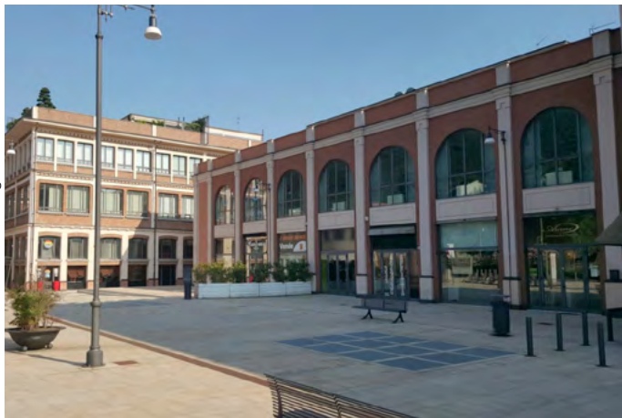
Borgo Wührer

Sitografia: https://it.wikipedia.org/wiki/Borgo_W%C3%BChrer