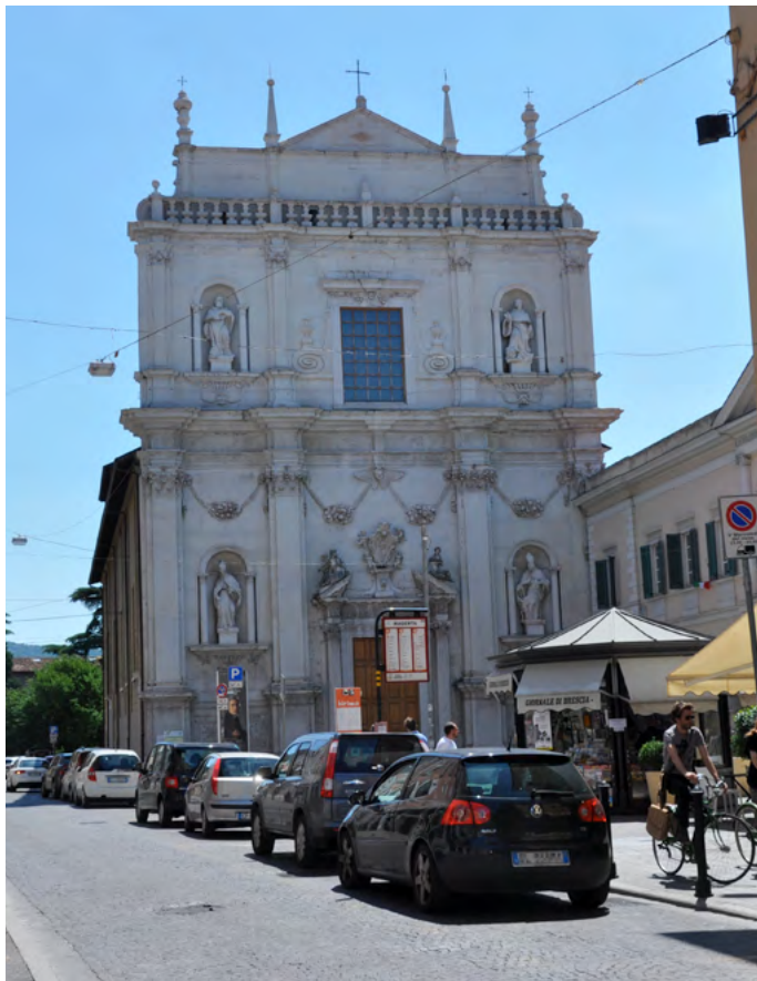
Auditorium San Barnaba

their scandalous behaviour. The "Community of Observance of Lombardy" substituted for them, and in 1490 they built a library. The last alteration was the Baroque reconstruction that gave a marble facade to the building. Angela Merici frequented the church, and according to a tale, here there would have been her levitation. For this reason, many worshippers stop there and pray the saint. The church was then deconsecrated and today it is an auditorium and a conference hall. Its courtyard hosts "Luca Marenzio" conservatory, that also occupies a section of a nineteenth-century palace.