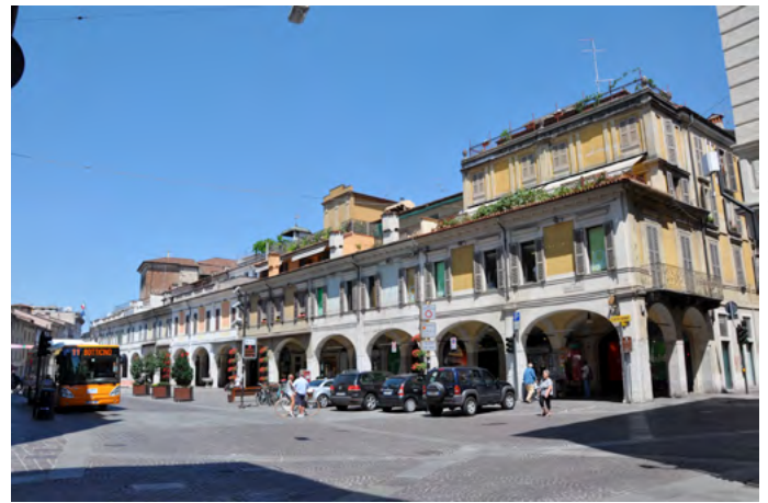
2011 Corso Zanardelli

www.iluoghidelsociale.it - Via Salgari,43 - 25125 Brescia - info@iluoghidelsociale.it