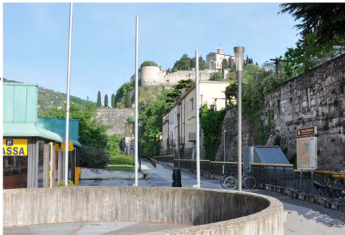
Fossa Bagni

Sitografia: http://www.bresciastorica.it/foto-storica-piscina-municipale-fossa-bagni/