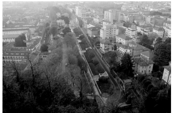
Veduta dal Castello

www.iluoghidelsociale.it - Via Salgari,43 - 25125 Brescia - info@iluoghidelsociale.it