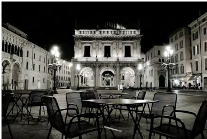
“Un pirlo per cortesia” “Campari o Aperol?”

Sitografia: http://www.lombardiabeniculturali.it/architetture/schede/LMD80-00117/