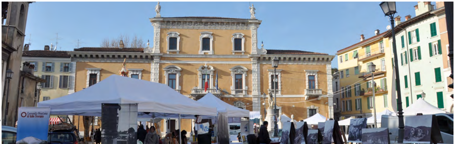
Incanto d'inverno

Sitografia: http://itineraribrescia.it/cultura/piazza-del-mercato/