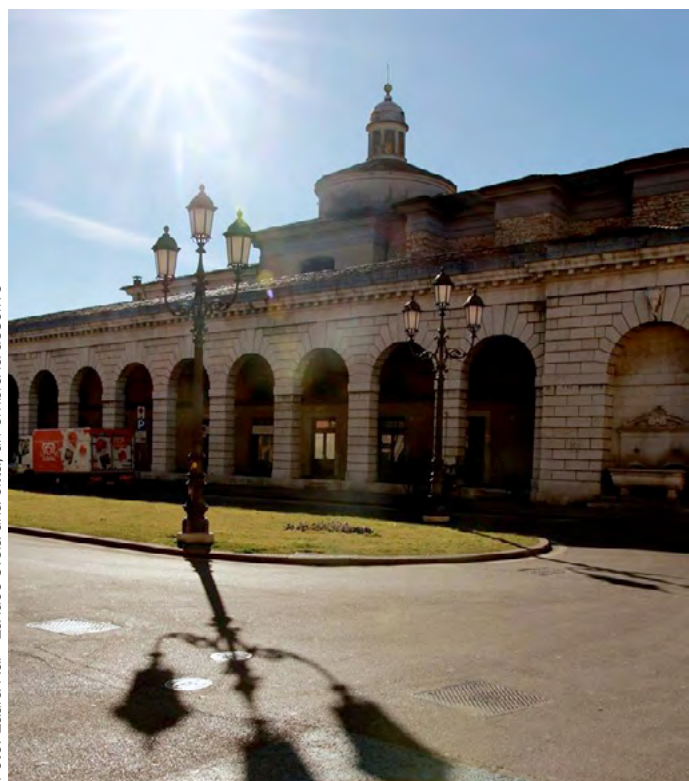
La luce svela una città, un'ombra la descrive

Sitografia: http://www.bresciastorica.it/foto-storica-piazzale-arnaldo-brescia-novecento/