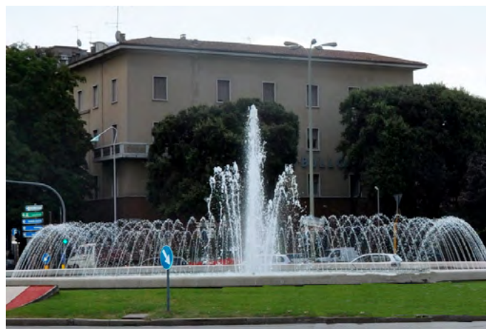
150 ma non li dimostra

www.iluoghidelsociale.it - Via Salgari,43 - 25125 Brescia - info@iluoghidelsociale.it