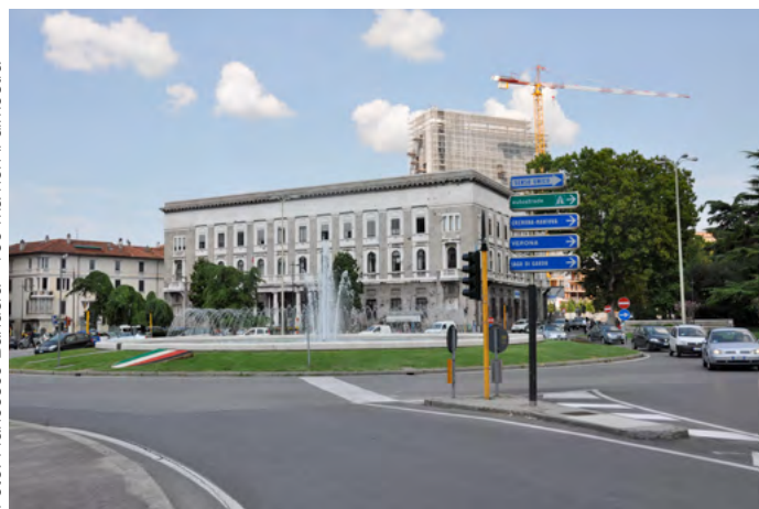
150 ma non li dimostra

Sitografia: http://www.brescistorica.it/foto-storica-stazione-ferroviaria-piazza-repubblica-brescia/