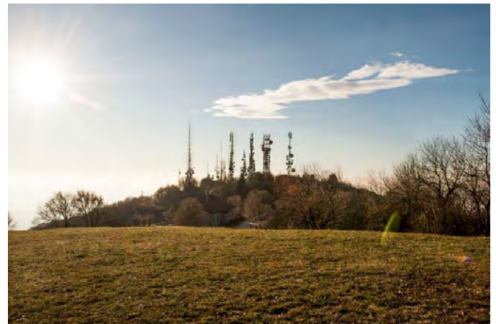
Monte Maddalena

www.iluoghidelsociale.it - Via Salgari,43 - 25125 Brescia - info@iluoghidelsociale.it