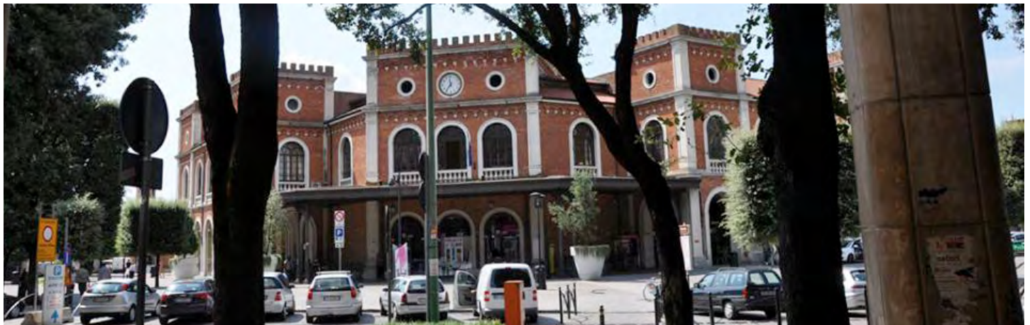
La stazione

Sitografia: http://www.stazionidelmondo.it/bresciastazione.htm