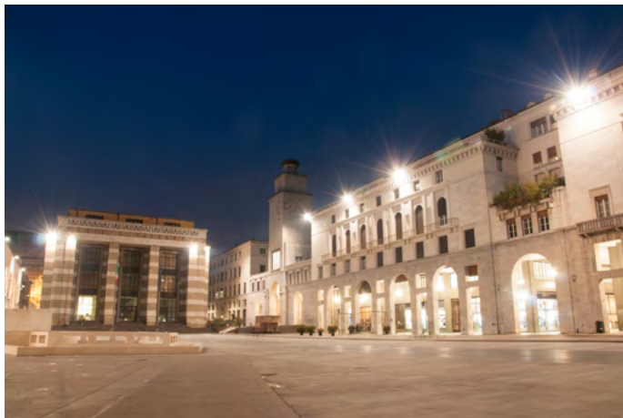
Vittoria in bianco

Sitografia: http://www.bresciastorica.it/foto-storica-piazza-della-vittoria-brescia-anni-trenta/